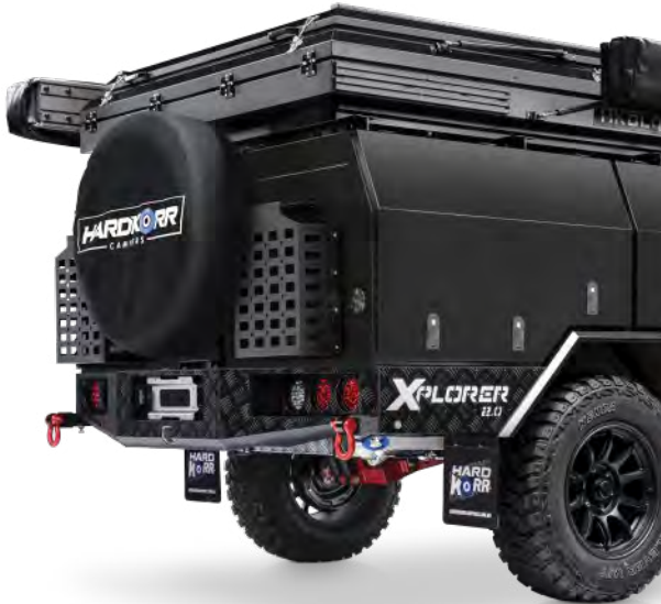
Overseas model shown. Subject to change without notice.

Purposely designed to fit in the garage, the Shorty measures up at just 1980mm high meaning that, after a trip, it can be quickly unpacked, charged up, and stored more securely and conveniently, within the comfort of your own home.