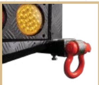
Rear Recovery Point